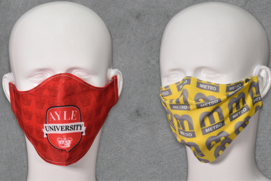
🛒 Regular Branded Face Masks 25 from £139