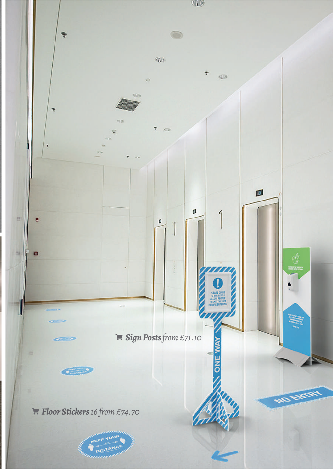
🛒 Sign Posts from £71.10