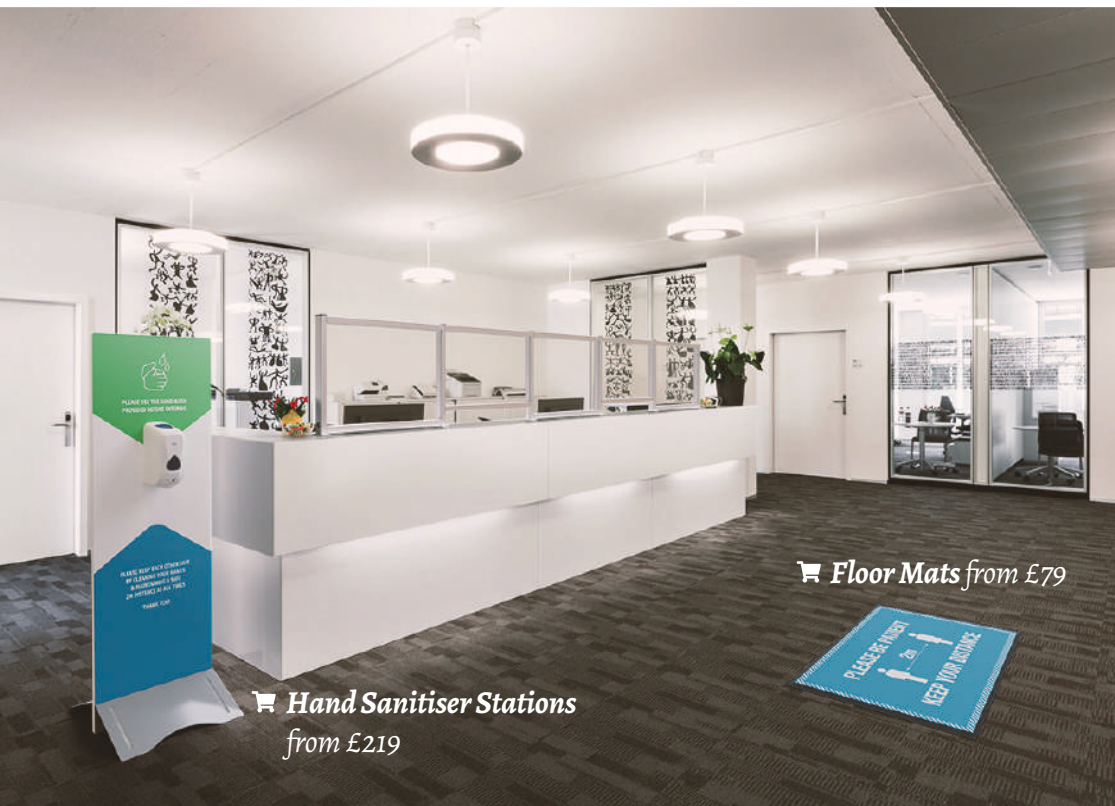
🛒 Floor Mats from £79